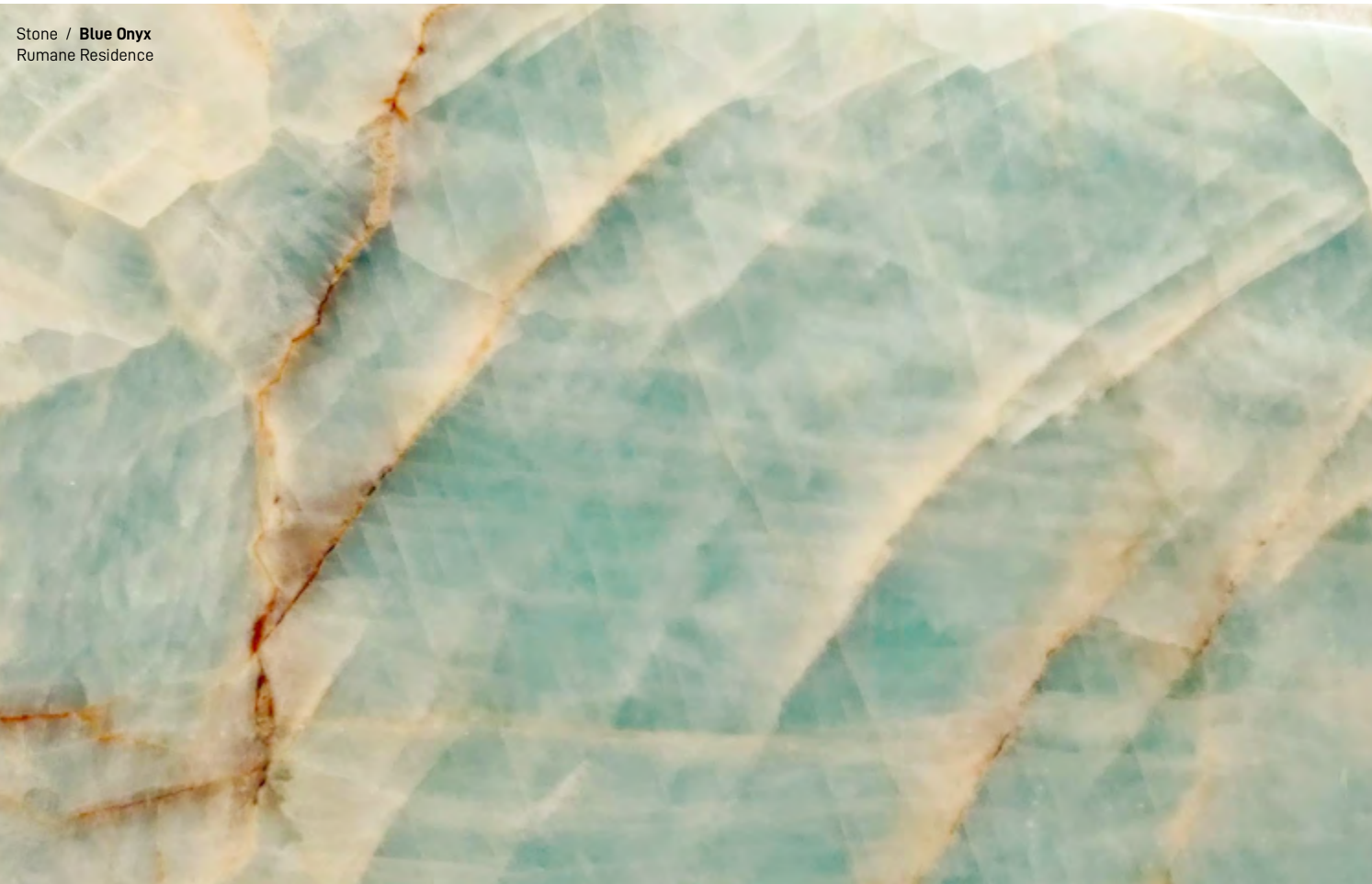
Stone / Blue Onyx Rumane Residence