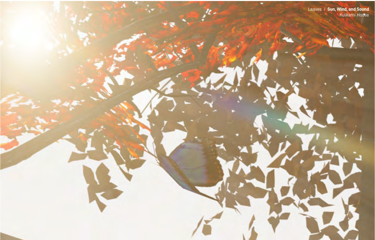
Leaves / Sun, Wind, and Sound Kulkarni House