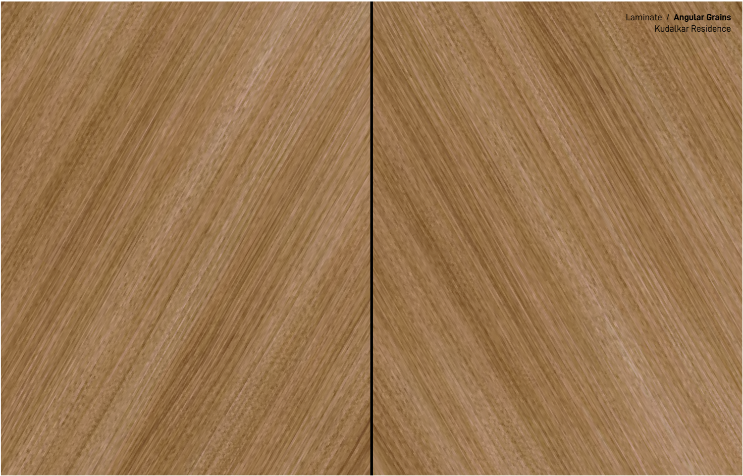
Laminate / Angular Grains Kudalkar Residence