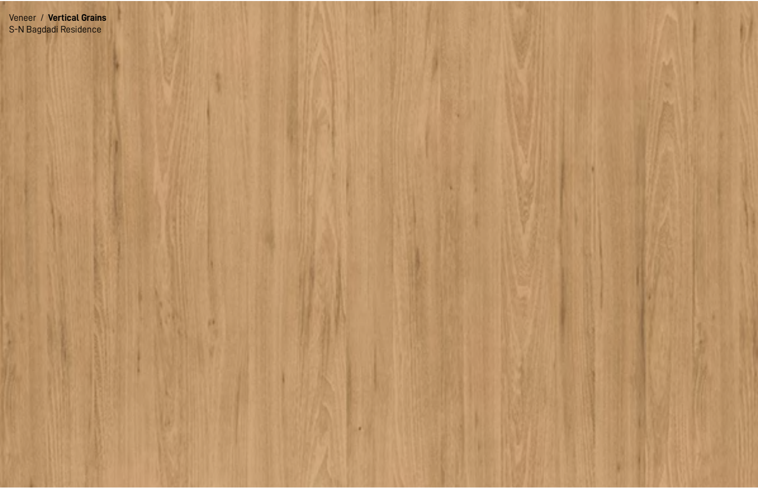
Veneer / Vertical Grains S-N Bagdadi Residence