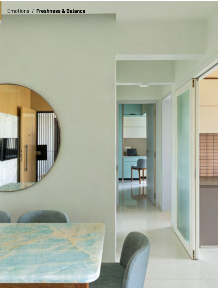
Top / Ruman Residence Bottom / S-N Bagdadi Residence

Colors and more, matter to us to communicate with our senses in order to shape us well.